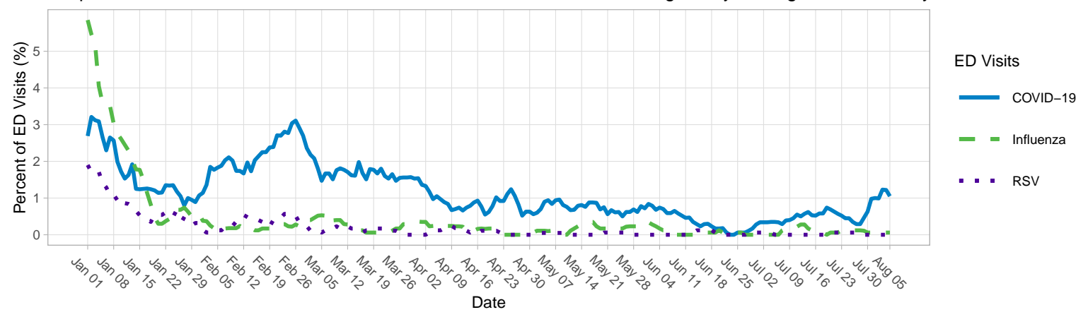
Table 1: Recent Trends of ED Visits, Davis County, Utah, for Week Ending Aug 05, 2023